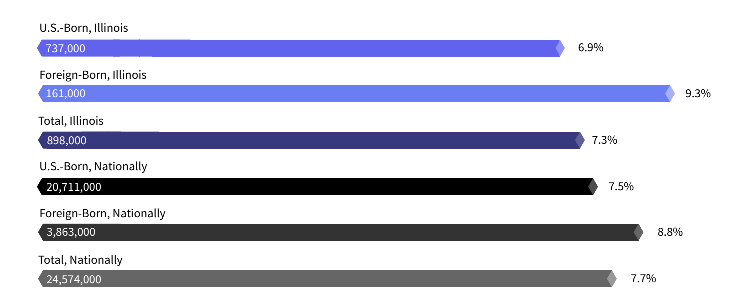
TABLE 1: SHARE OF INDIVIDUALS WITHOUT INTERNET, BY NATIVITY, 2019

did not have internet access at home during the same period.