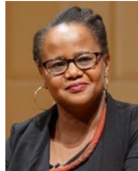
Edwidge Danticat National Book Award Winner