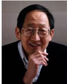
Daniel Tsui Nobel Prize-Winning Physicist