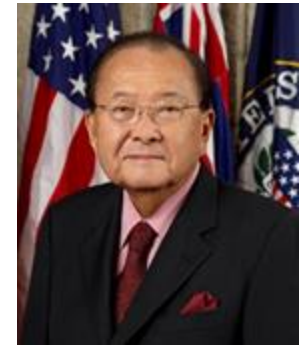
Daniel Inouye U.S. Senator