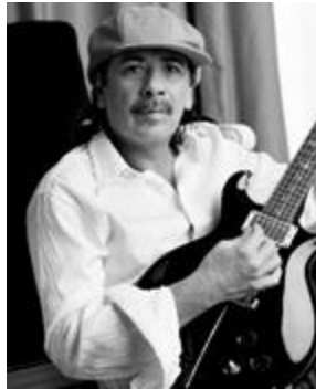
Carlos Santana Musician & Activist