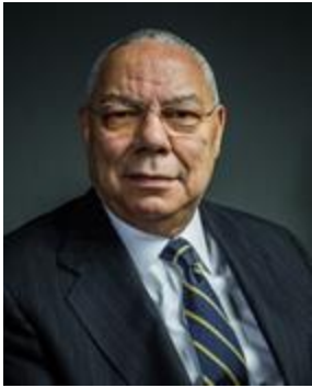
Colin Powell Secretary of State