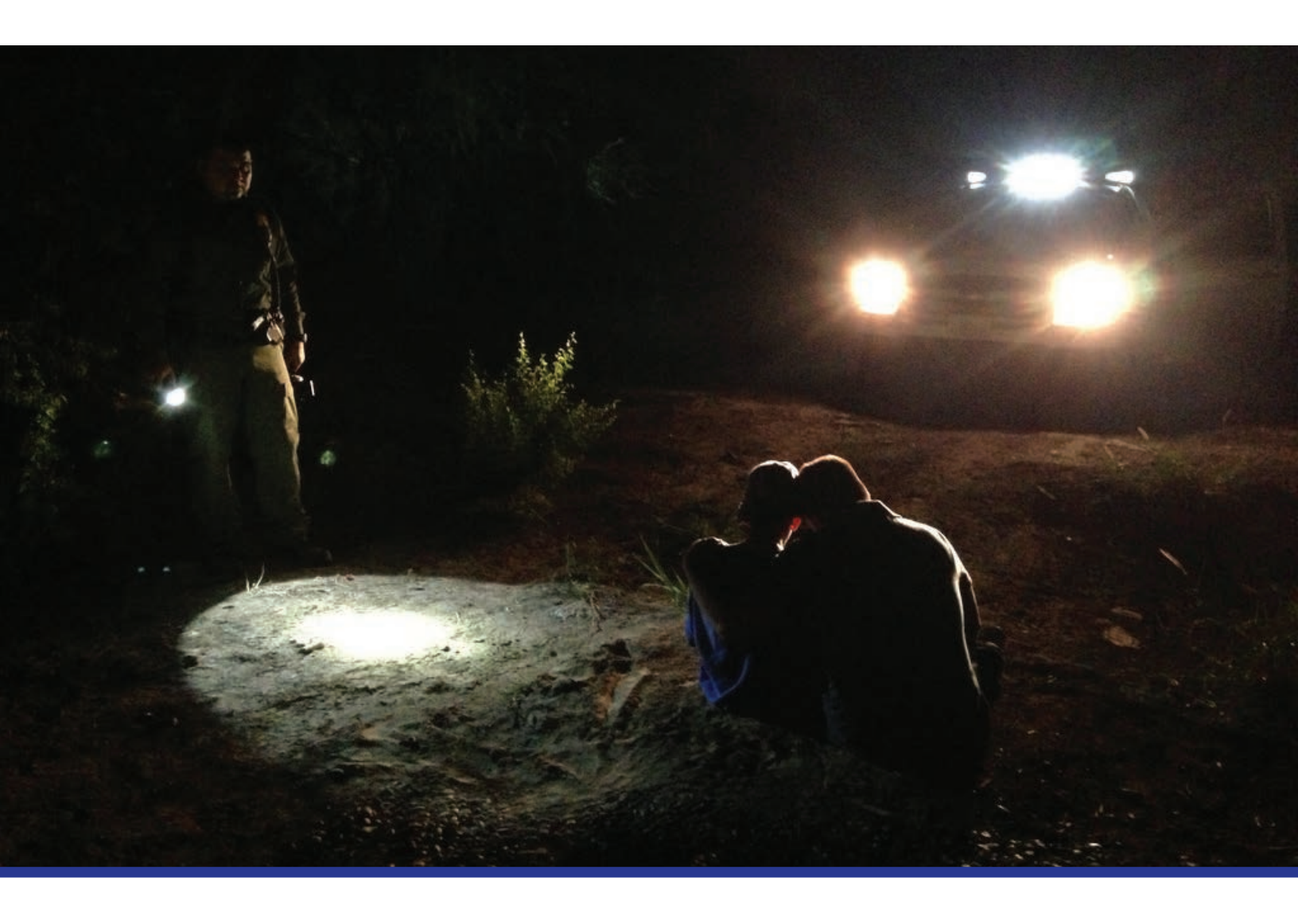
Part II: Possessions Taken and Not Returned

The Routine Abuse of Migrants in the Removal System