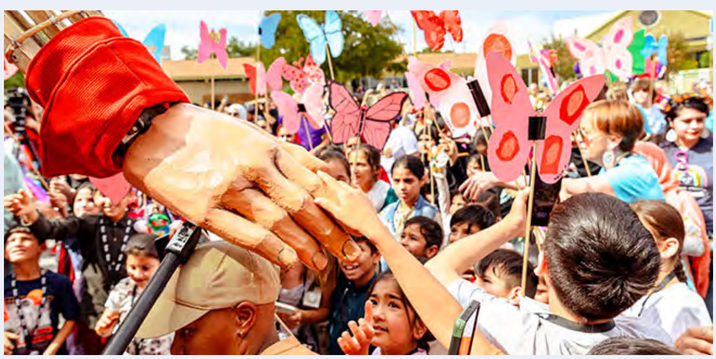
Little Amal in San Antonio

ffective messaging and counter-messaging to combat the rising prevalence of anti-migrant rhetoric, misinformation, and disinformation is essential in today's immigration climate. Compelling storytelling and reality-based narratives built around unifying language move the hearts and minds of skeptics in the middle and