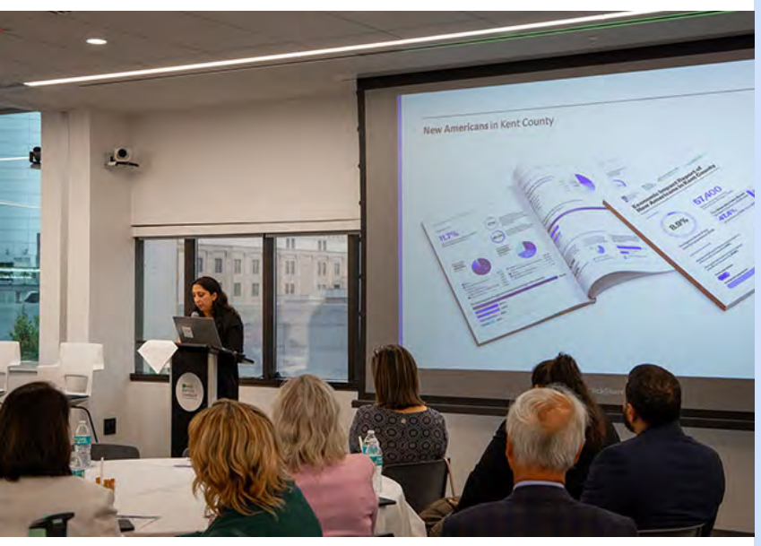
Presenting a research report in Kent County, Michigan

he Council's research team played an essential role across the organization to employ sophisticated data analysis and data science techniques to elevate colleagues' and coalitions' work. The work of this team is central to our organization's ability to ground the discourse in facts and sound analysis.