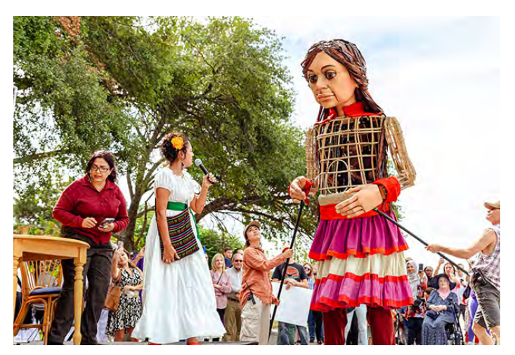
Little Amal in San Antonio, Texas

he Council was a proud national partner of the Little <u>Amal Tour</u>, an internationally celebrated 12-foottall puppet of a 10-year-old Syrian refugee girl that has been welcomed in more than 250 artistic events across the globe. Her urgent message to the world is "Don't forget about us," highlighting the fact that half of all refugees are children. The project celebrates the cultural diversity, migration stories, and contributions made by refugees and immigrants. Little Amal embarked on a 6,000-mile nineweek-long journey across the United States in September and was featured at more than 100 artistic events across 40 towns and cities where immigrants settled and built new and cherished communities. Her journey shows how art can be a tool for understanding and sparking conversations on difficult subjects.