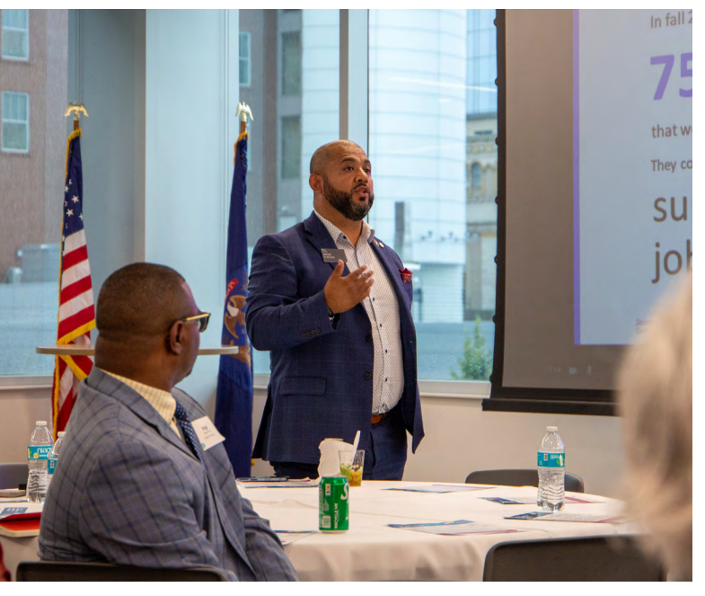
Global Talent Chamber Network annual convening

State and local engagement is an inroad to promoting immigration reform, especially when federal policy change is at a stalemate. It is also a critical messaging avenue to combat rising state-level restrictionism, misinformation, and disinformation.