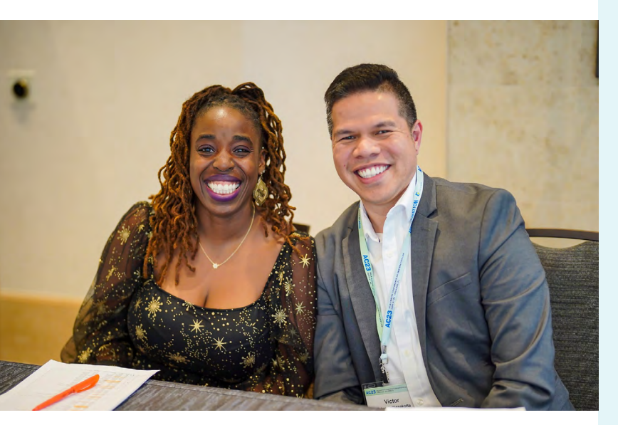
Council staff at the AILA National Conference in Orlando

Merging and harmonizing two different organizational cultures remotely has been a challenge for the organization and various teams. We learned that investing early on and remaining intentional about the work to build an effective and unified staff with a shared vision is essential. By doing so, we have been able to create the conditions necessary to expand our recruitment and hiring to now include staff in 19 states. Recognizing there is no substitute for in-person relationships and trust-building, we have been intentional in planning in-person gatherings to build cohesion and camaraderie. In October, staff gathered in Montgomery, Alabama, and reflected on the complicated racial history of our nation — and how it impacts our work together — at the Equal Justice Initiative Legacy Museum and The National Memorial for Peace and Justice. Many staff were present at the AILA National Conference in Orlando in July and were able to connect with stakeholders, partners, and each other.