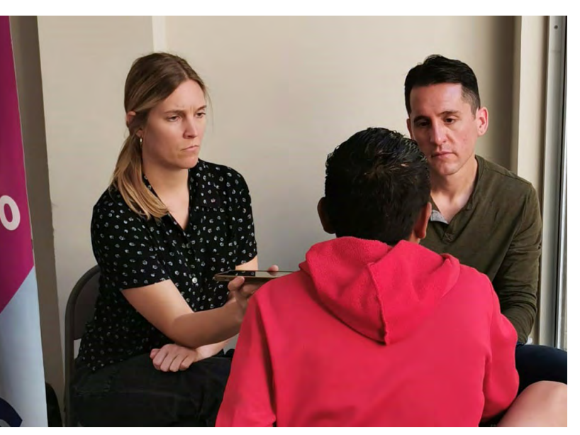
Council staff at site visit to the border

Crafting solutions that work for the most difficult immigration challenges facing our country: In May, the Council published <u>Beyond A Border Solution:</u> <u>How to Build a Humanitarian Protection System That Won't</u> <u>Break</u>. Through these 13 recommendations, the Council believes that we can create a system for asylum processing that is flexible, orderly, and durable, respects the rights of asylum seekers, inspires confidence in the American public, and ensures that the United States remains a beacon of safety.