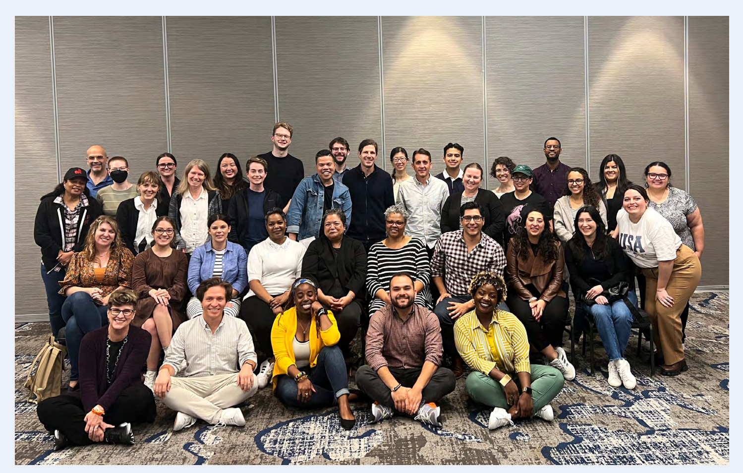
Council staff at our staff retreat in Montgomery, Alabama

he American Immigration Council has fully incorporated the strengths of two entities into one merged organization that now houses a breadth of expertise, strategies, programs, and sophisticated tools like no other organization in the field to support immigrants, promote belonging and welcoming in the communities where immigrants settle, and successfully advocate for changes to modernize our country's immigration policies.